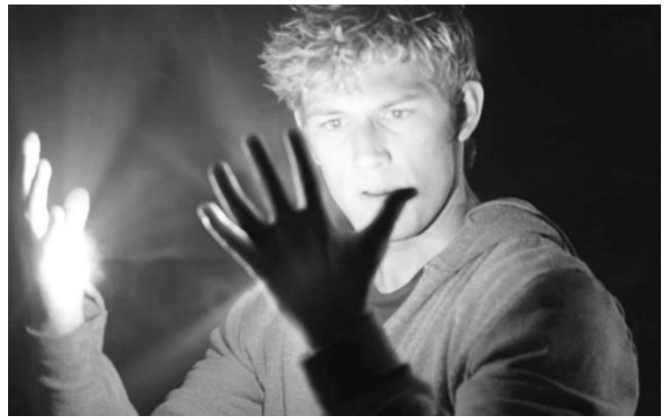
10. Sometimes I thought my friend had strange powers. Every time he was around...