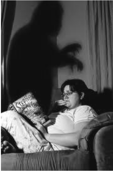
9. I was reading a book when I looked up. There in the window I saw...