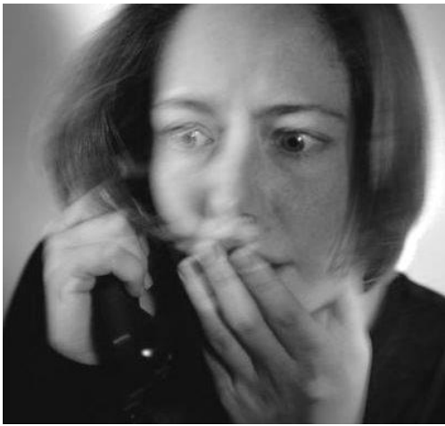
7. Something was drastically wrong! Every time I picked up the telephone...