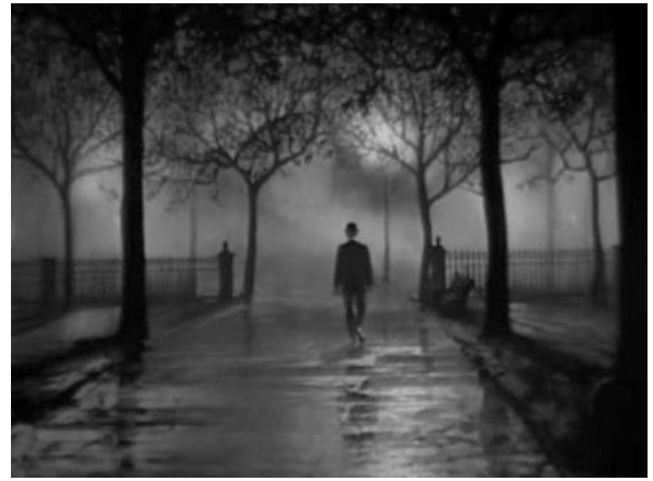
8. I decided to go for an evening stroll. I walked about three blocks when I felt it...