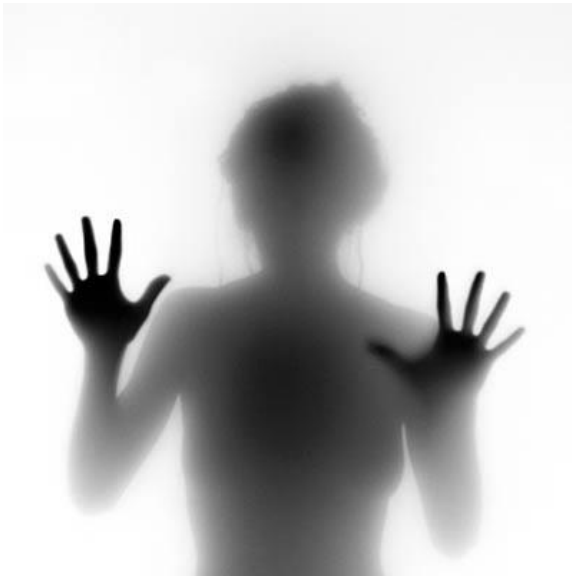
11. All of the sudden I was trapped!